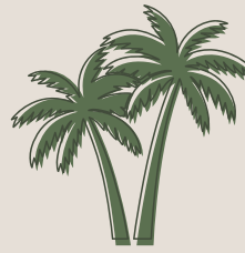
TABLE TWO NINE