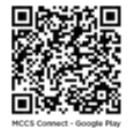
MCCS Connect - Google Play